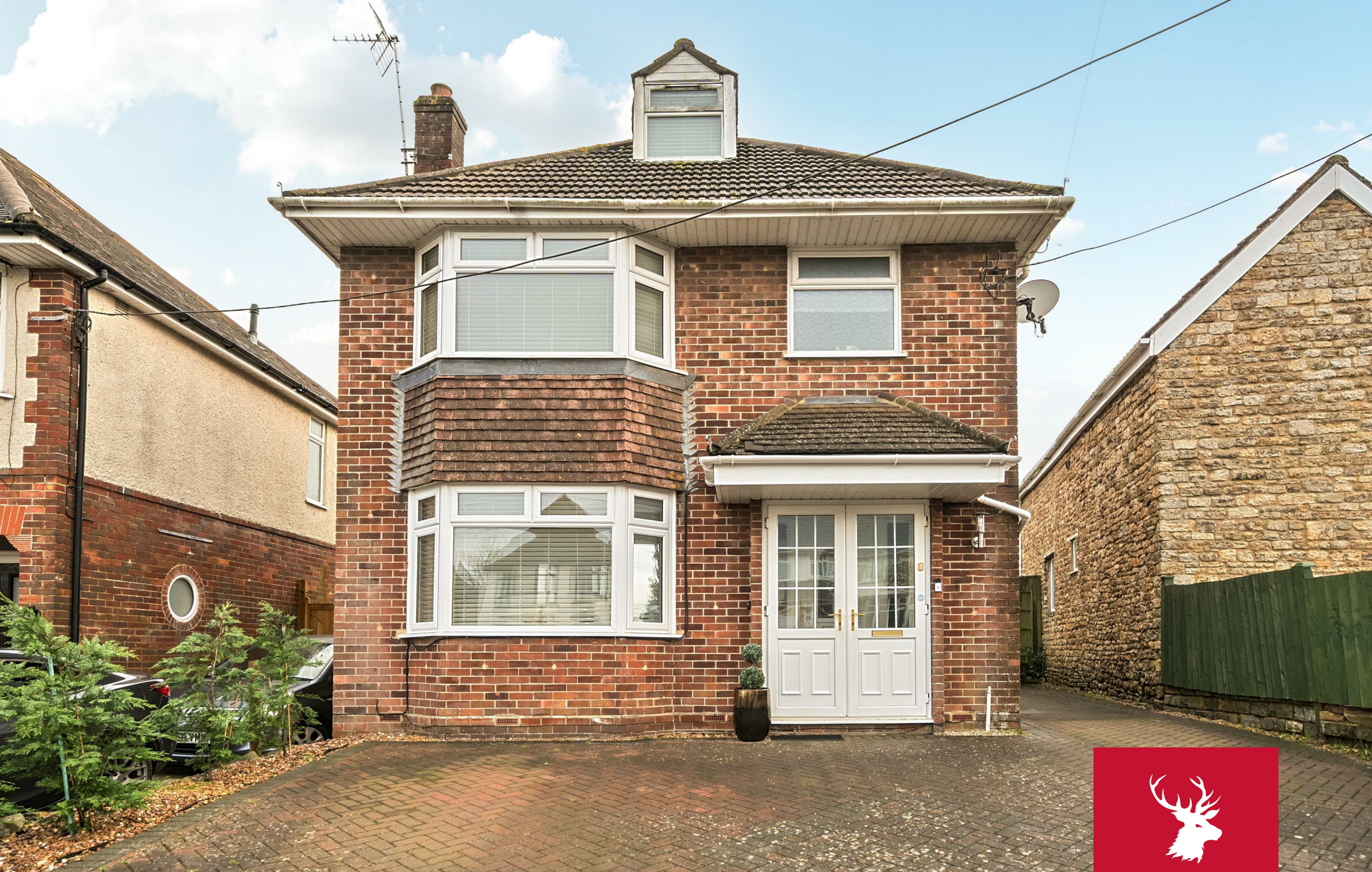
Saxon House, 152, Mudford Road